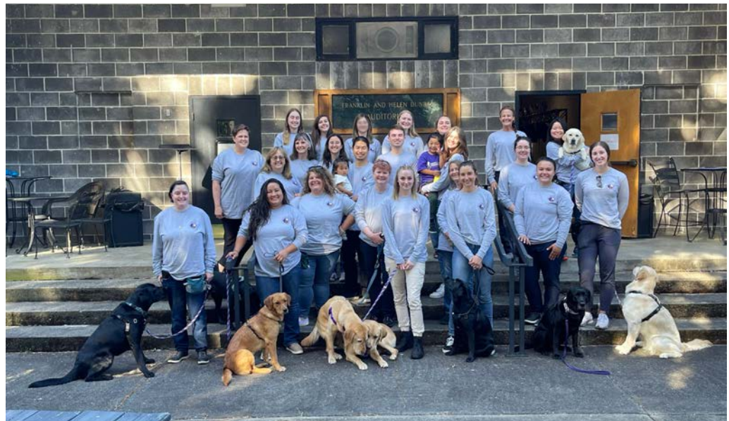
Paws for Purple Hearts Staff, Canyonville, OR

At the very start of the summer, the Paws for Purple Hearts teams were finally able to gather together and hold our all staff conference at our brand new National Campus in Canyonville, OR. Employees from around the country joined together for educational meetings and presentations, as well as laughter and community engagement.